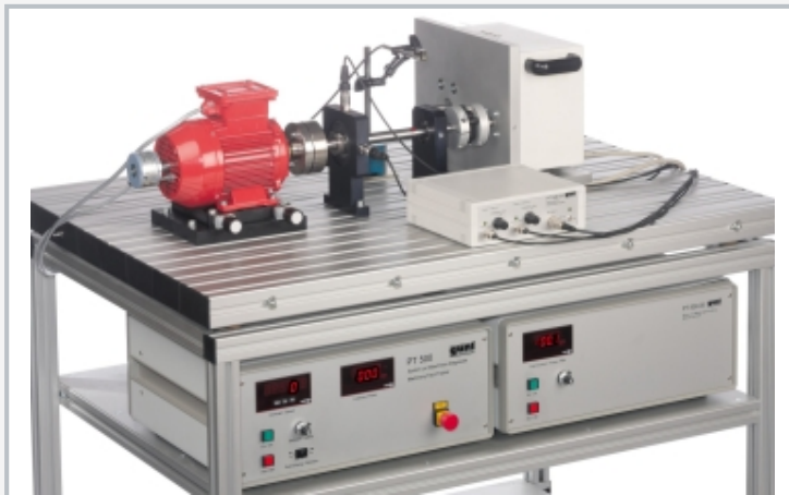
The illustration shows PT 500.13 together with PT 500, PT 500.01, PT 500.05 and PT 500.04.