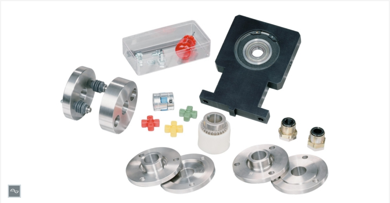
The illustration shows PT 500.13 together with the claw coupling of PT 500.